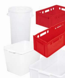
CONTENITORI IN PLASTICA