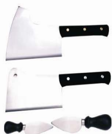
MANNAIE COLTELLI DEDICATI