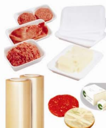
MATERIALE DI CONSUMO