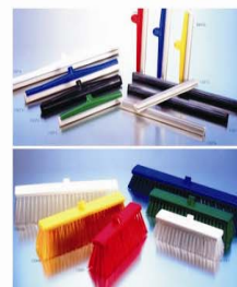
SISTEMI PER LA PULIZIA